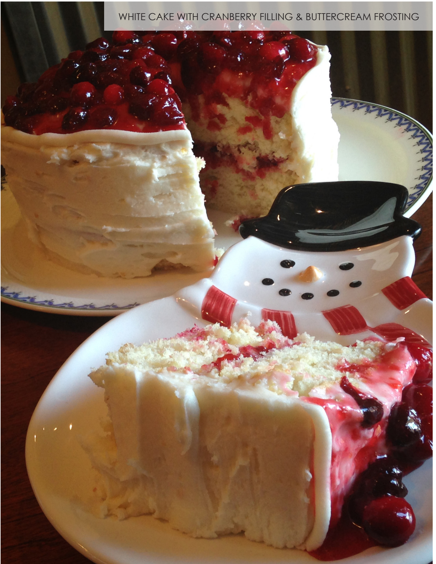
WHITE CAKE WITH CRANBERRY FILLING & BUTTERCREAM FROSTING