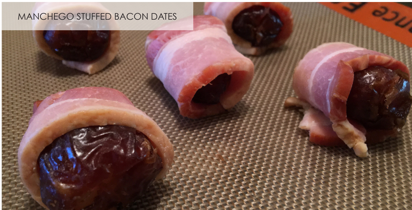
MANCHEGO STUFFED BACON DATES