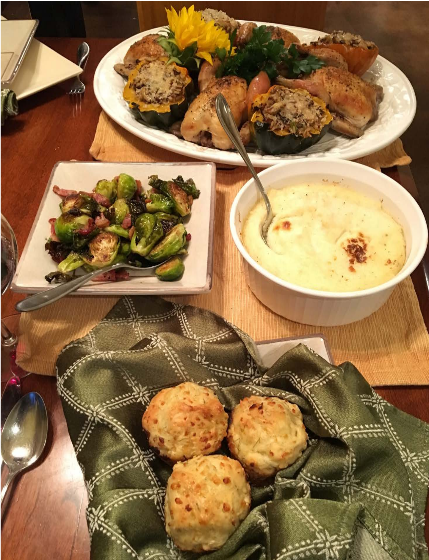
12 THE MAIN COURSE