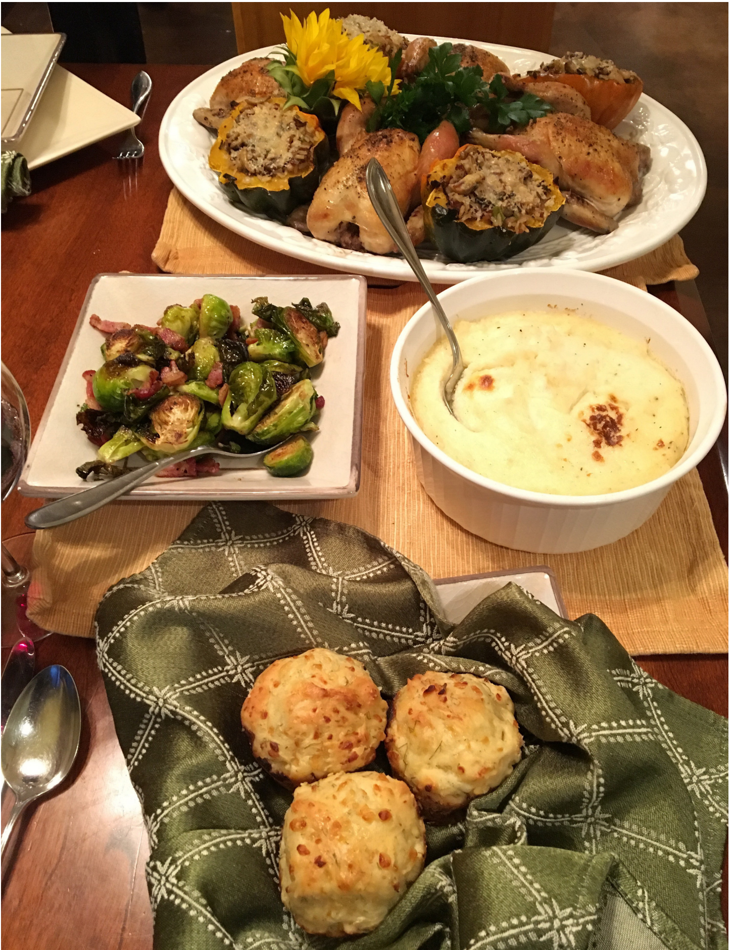
12 THE MAIN COURSE